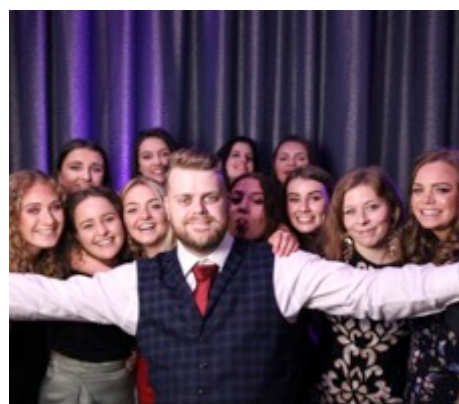
Fundraising Secretary: TBC